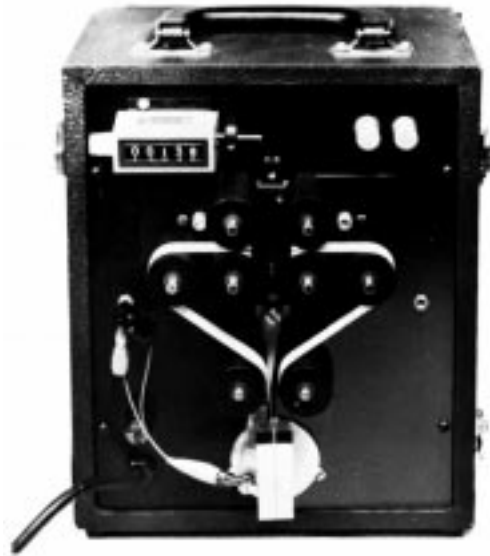
FIG. 2 Fatigue Ductility Flex Tester, Model 2 FDF

mens, with the dimensions as specified herein. The specimens may be prepared individually by use of a double-bladed cutter. The cutting edges of the blades should be lubricated with a material such as stearic acid in alcohol or other suitable material. The finished specimens shall be examined under about 20\times magnification to ascertain that the edges are smooth and that there are no surface scratches or creases. Specimens showing discernible surface scratches, creases, or edge discontinuities shall be rejected.